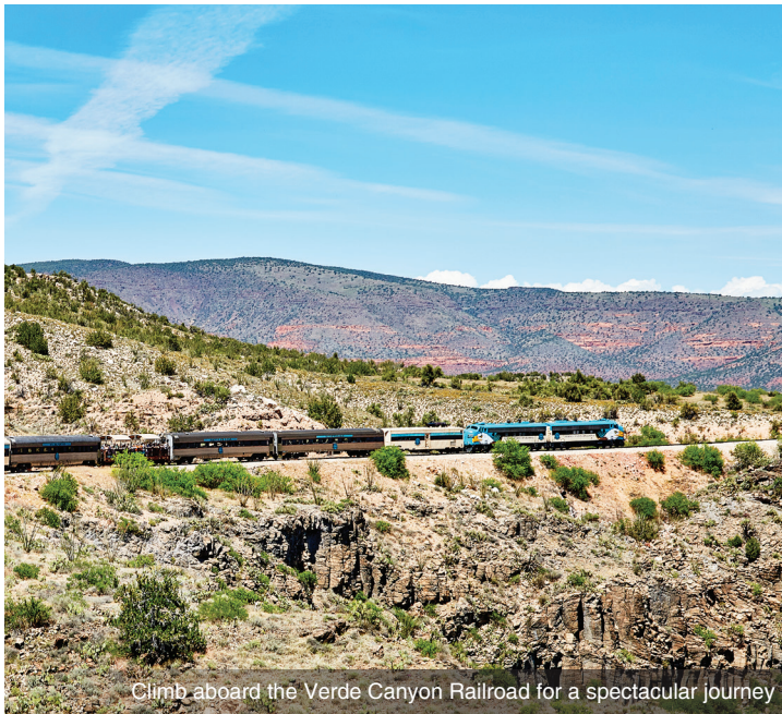
Climb aboard the Verde Canyon Railroad for a spectacular journey

DAY 5 Verde Canyon Railroad: This morning, stop in Jerome, an old mining town and melting pot for those who dreamed of making a quick fortune. Once virtually a ghost town, it is now restored with shops, museums and art. Later, climb aboard the Verde Canyon Railroad for a spectacular journey over old-fashioned trestles, past ancient Indian ruins and through a 700-foot tunnel. Enjoy the views from the comfort of your First Class seat or from one of the open-air viewing cars. Watch for wildflowers, blooming cacti and wildlife in their natural habitat. Tonight, chow down with a chuckwagon supper at the “Blazin’ M Ranch” and Western Stage Show. Meals: B, D